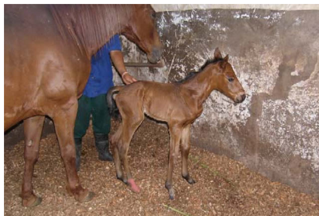
Fig 1: Foal with distal aspect of right hindlimb bandaged.

On inspection the foal had no other obvious gross abnormalities and appeared normally proportioned for his age. He had a body condition score of 2.5/5. On physical examination, cardiac and pulmonary auscultations were normal. In addition no cleft palate, hernias or ocular lesions were identified, and the limbs showed no evidence of angular limb deformities. Flexion and extension of all 4 limbs were also noted to be within normal limits. However, on the right hindlimb, the digit appeared to end in a stump suspended 6–8 cm above the ground. On removing the bandage the stump was observed to be surrounded by hair with a hyperaemic soft tissue covering on the solar aspect ending just below the