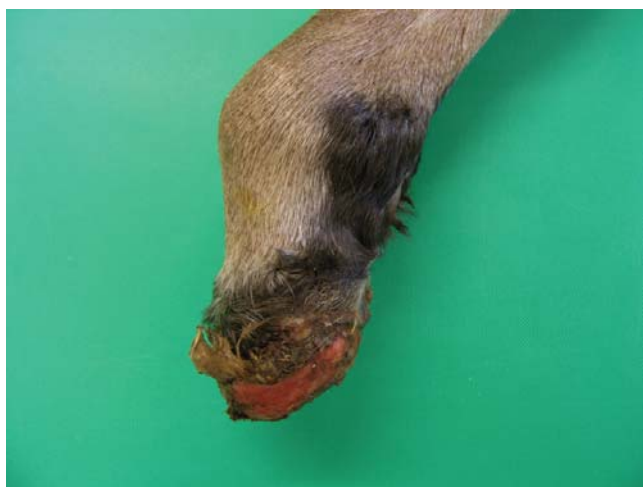
Fig 3: Close-up view of the limb in Figure 2.

be cartilage and, according to the pathologist, histological examination of this structure would have revealed no further information.