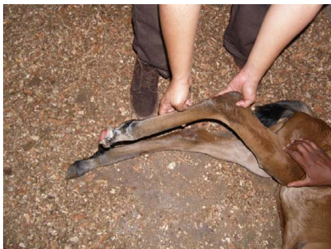
Fig 2: Abnormal right hindlimb.

With the exception of the affected limb, no gross abnormalities or congenital defects were identified on routine post mortem examination. Radiographs were taken of both hindlimbs from the stifle distally for comparison. The left hindlimb appeared normal, but the right hindlimb showed no evidence of bones distal to the proximal phalanx (P1). There was a small unidentified structure with the radiopacity of bone just distal to P1 ( Fig 4 ) but there was no hoof wall present. On further examination of this radiopaque structure, it was found to