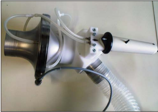
Fig 03: Measuring head with both pneumotachograph and pressure transducers.